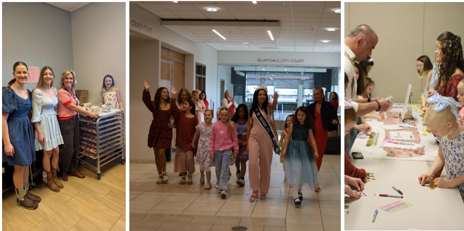
Left: Youth Council volunteers in the kitchen ; Middle: Miss and Little Miss Bluffdale contestants practice walking ; Participants make a craft

This year we had the privilege to help with the Little Miss Tea Party, where the Little Miss girls had a chance to eat brunch with and meet the Miss Bluffdale 2026 contestants. They also did a craft and practiced their princess walk! We love connecting with the girls and learning about the Miss Bluffdale contestant's platforms.