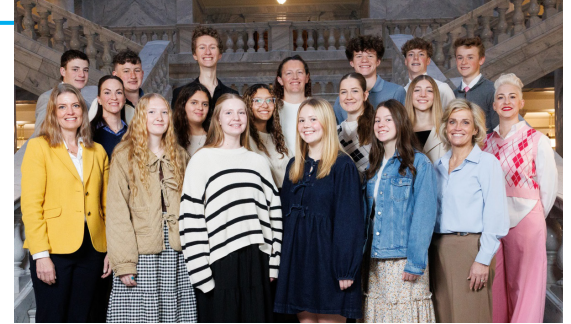
Youth Council at Utah State Capitol on Legislative Youth Day

In January, the Youth Council provided a community BINGO night. I saw them spend hours planning and implementing this activ-